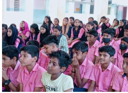
Awareness class using Mftl

An awareness using mobile food testing laboratory was conducted for around 40 students at KKPM UP School, Varinjam , Chathannoor circle on 30/01/2024 under the guidance of MFTL technical assistant.