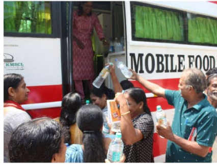
Awareness class for Public and FBOs -(26-02-2024)