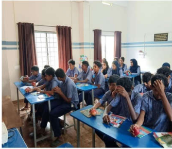
Awareness class for School Students(9-2-24, 11 am)