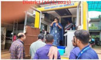
Inspection at Fish market -Ulickal, Kannur District (26/06/2023)