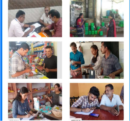
Operation FOSCOS (6/2/2024)-Kannur